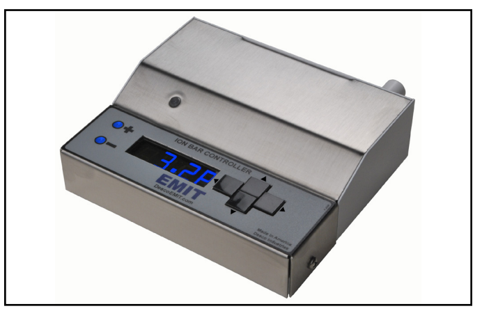
Figure 6. EMIT 50855 Controller with Digital Adjustment