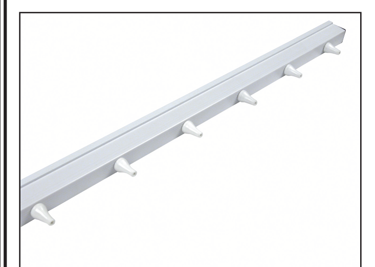
Figure 1. EMIT Air Assisted Ion Bar