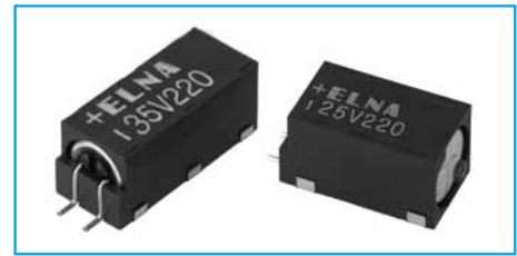
Marking color : White print on a black case