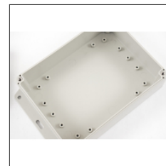
Internal mounting points for PC boards or panels