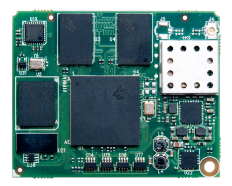
AM3517 SOM-M2 *Enlarged to show detail

The compact size of the AM3517 SOM-M2 is ideal for medical patient monitoring wearables and other portable instrumentation applications. The AM3517 includes an SGX530 graphics accelerator and wired 10/100 Ethernet. For commercial signage, medical imaging, avionics, and industrial displays, the AM3517 SOM-M2 allows for powerful versatility, long-life, and greener products.