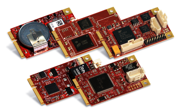
Mini PCle Modules

Call VersaLogic Sales at (503) 747-2261 for more information!