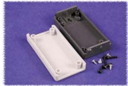
Assembled View (Bottom)