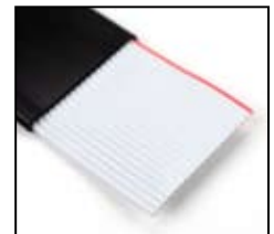
3M™ Jacketed Flat Cable