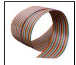
3M™ Color Coded Flat Cable