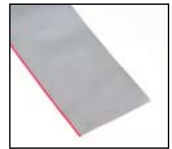
3M™ Round Conductor Flat Cable