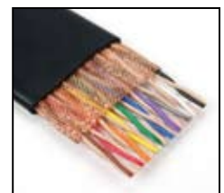
3M™ Twisted Pair Shielded Jacketed Flat Cable