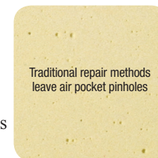
Traditional repair methods leave air pocket pinholes

3M's enhanced cartridge design delivers the perfect ratio of mixed product to the car's surface. With traditional mixes, up to 40% of the product can end up unused. However, with 3M's Dynamic Mixing System, you don't lose what you don't use – significantly reducing waste . The absence of air in the cartridge and mixing nozzle prevents over-catalyzation and virtually eliminates pinholes. Within this sealed environment, the filler or glaze and hardener are mixed to a perfect ratio – for outstanding results in less time.