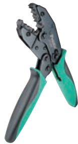
300-054 Lunar Crimp Frame