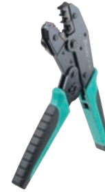
CP-3005F Quick Interchange Ratcheting Crimper Frame

Note: CP-3005F sold as frame only, but all dies on this page fit it