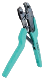
300-096 Ergo-Lunar Crimp Frame