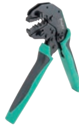
902-085 CrimPro Crimp Frame