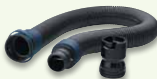
BT-30 Length Adjusting Breathing Tube