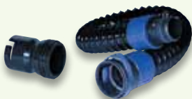
BT-20S/BT-20L Light Duty Breathing Tube

All BT-Series breathing tubes feature the QRS (Quick Release Swivel) connection for maximum comfort and ease of use.