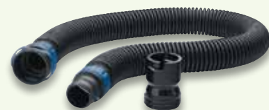
BT-40 Heavy Duty Breathing Tube