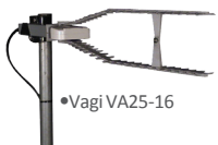
• Vagi VA25-16

The Vagi/Yagi Series are rugged, easy-to-install, high-gain directional antennas used in a wide variety of wireless systems where low cost, good performance and low wind loading are important factors. They include either a VPOL or HPOL configuration, along with a 1.5 VSWR as well. These antennas can be pole mounted in outdoor environments.