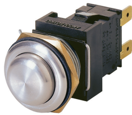
H8300RP - - -