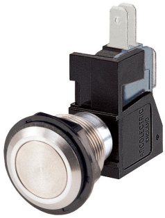
C0911VA - - -