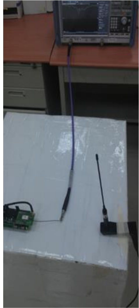
in free space, through reference board