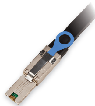
3M™ High Routability External MiniSAS Cable Assembly